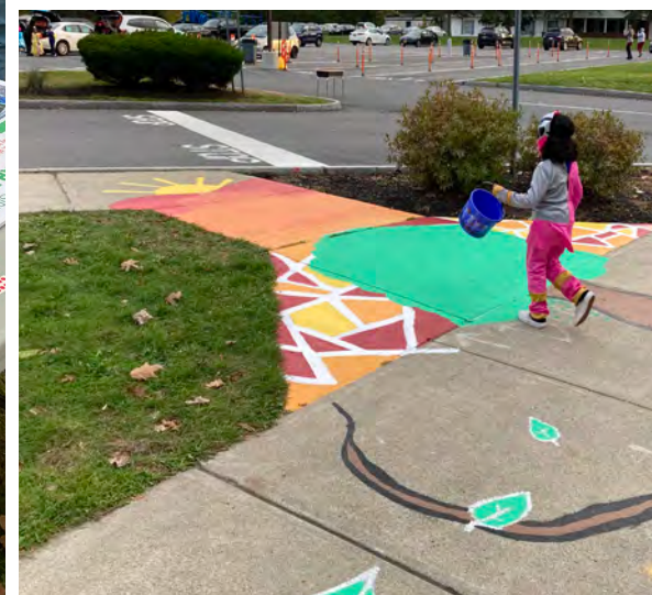
▲ KIPP Tech Valley Trunk or Treat Event. Parents and students shown placing sticker dots on preferred amenities for the Greenway.