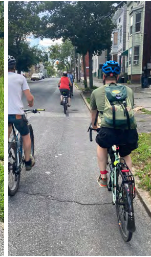
◀ Albany Bike Coalition Slow Ride Event. Bike tour through the Arbor Hill / West Hill neighborhoods and tour of the Underground Railroad Education Center.