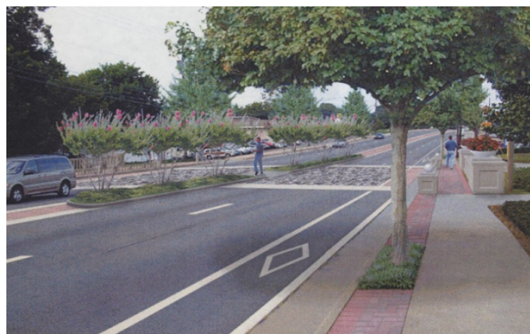
East Greenbush Routes 9&20 Design Enhancements