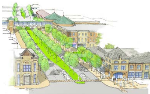
Hoosick Street Phase II Corridor Plan